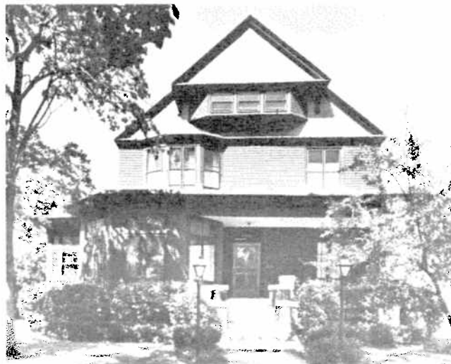
Kenwood has a large concentration of Shingle style houses, such as this one at 4950 Woodlawn Avenue. Its third-floor gables were probably once covered with shingles, as are the two lower floors.